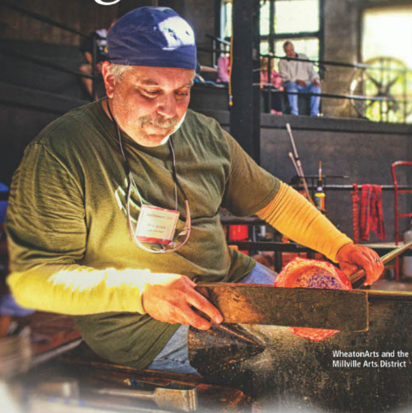
WheatonArts and the Millville Arts District